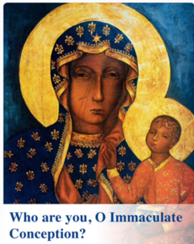
Who are you, O Immaculate Conception?